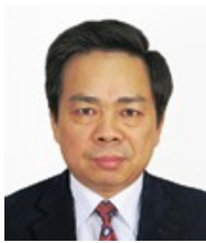
AAPPS-DPP chair & 2021 IOC Chair Baonian Wan

[2] Organization: AAPPS-DPP ( http://aappsdp.org/AAPPSDPPF/ ) is the organizing body of this conference. The AAPPS-DPP 2021 annual conference will be a remote on-line e-conference using Zoom systems similar to AAPPS-DPP 2020, which was quite successful with 930 participants from all over the world.